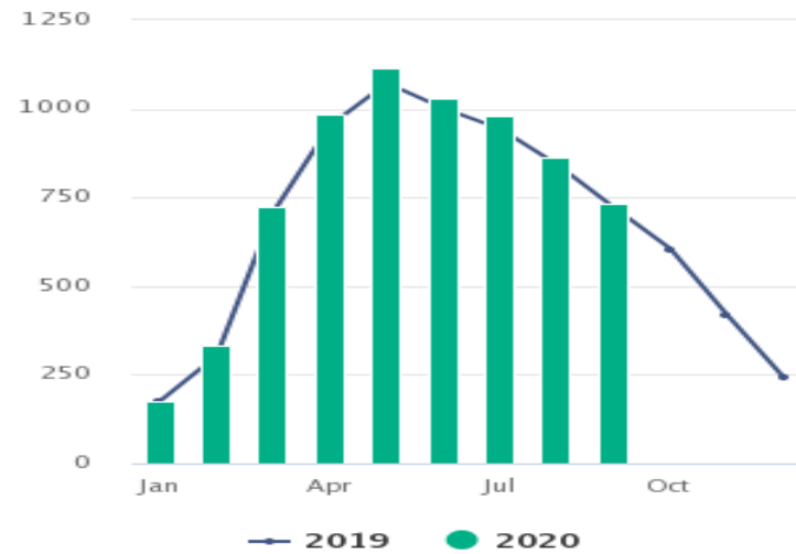
Figure 1 Domestic Milk Statistics